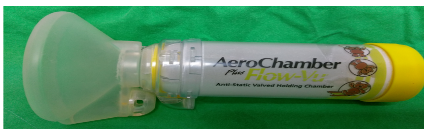
Figure 1: Aerochamber