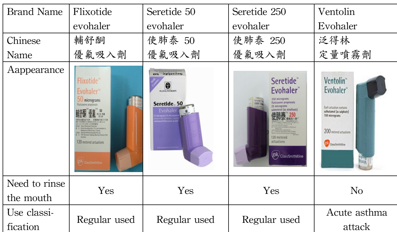
Table 1: Inhaled bronchodilator drug